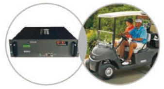
Golf cart Battery