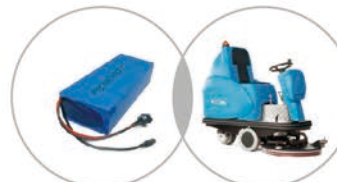
cleaning equipment battery