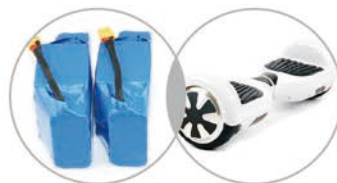
Balance scooter Battery